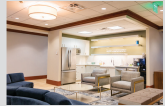
One Club (Kitchen)